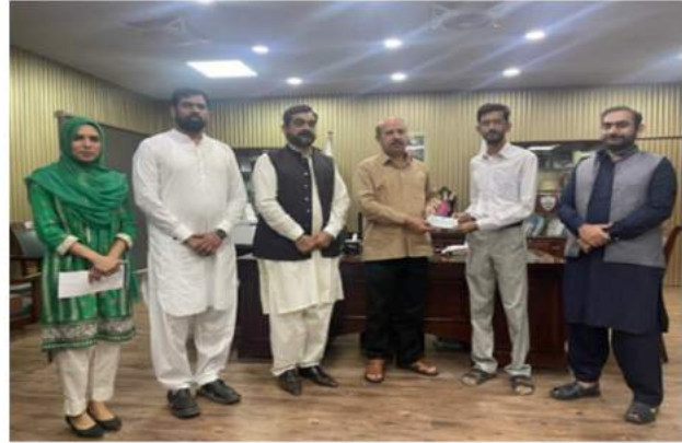
Distribution of Cheques of Rahmatul-il-Alameen Scholarship