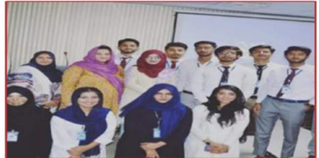
Department of business administration organized annual Fiesta.

Department of Business Administration in collaboration with Event Management society organized a quiz about knowledge of Islam. Students from different departments participated in the event. Department of Business Administration won the first position and department of applied psychology secured the second position