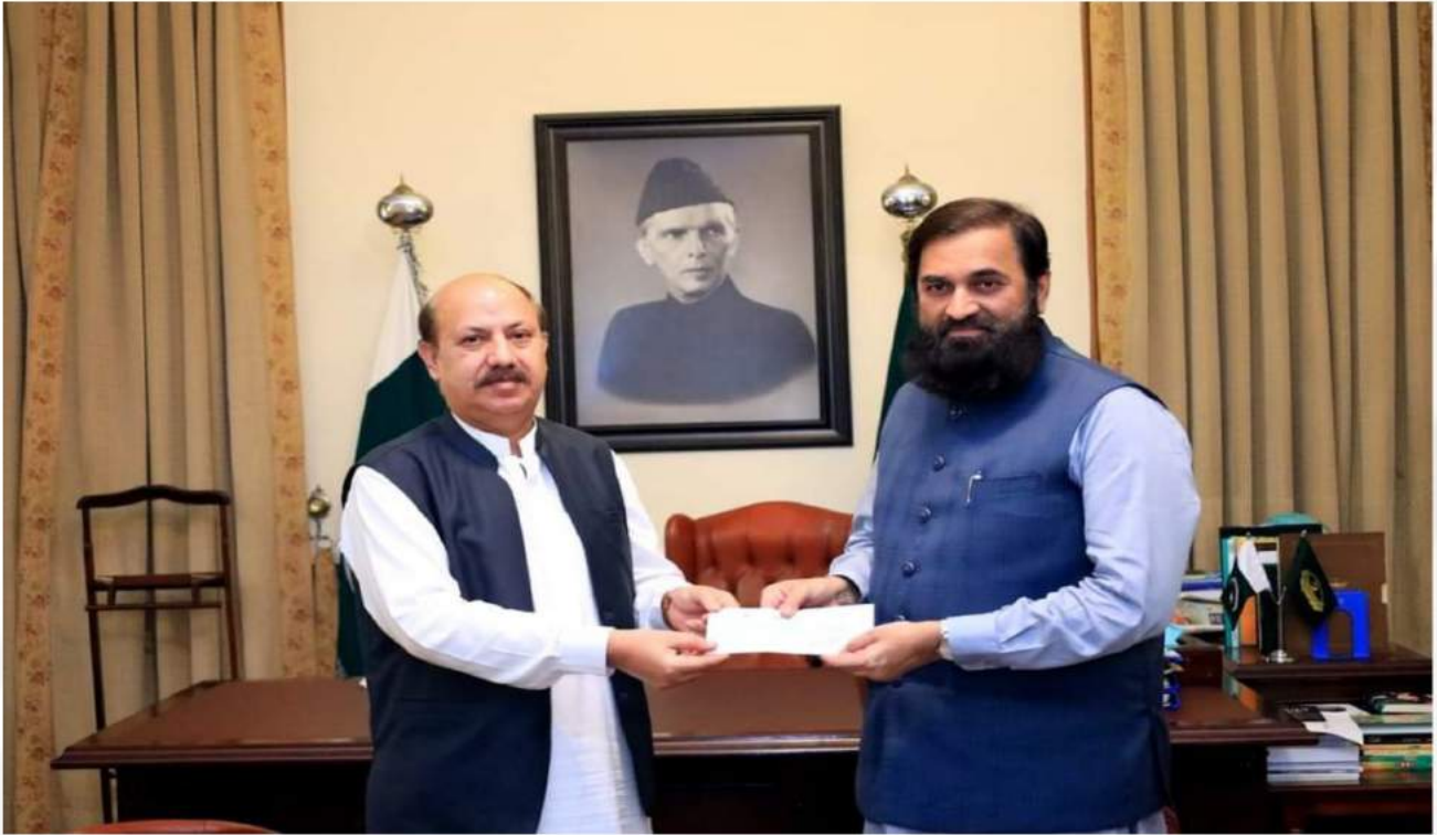
Collaboration between ORIC and PITB

The Office of Research, Innovation, and Commercialization (ORIC) takes great pride in its involvement with the community services the University of Sahiwal has to offer, including tree planting, flood-relief aid, making our youth skillful, and other outreach activities. The ORIC delightedly collaborated with PITB to build a Plan9 Technology Incubator at the Campus and made this venture a total triumph.