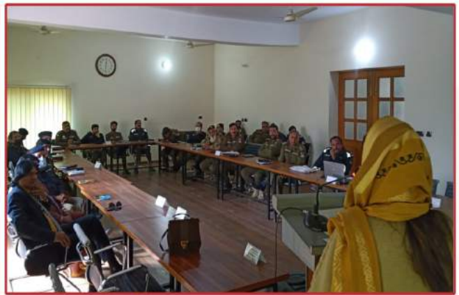
Seminar on Behavioral Cues and Body Language of Criminals, Better Public Dealing and Attitude Change