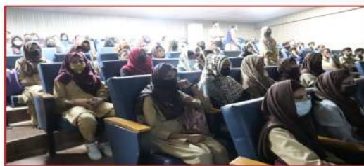
Orientation at The Department of Applied Psychology