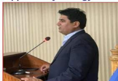
Orientation at The Department of Chemistry