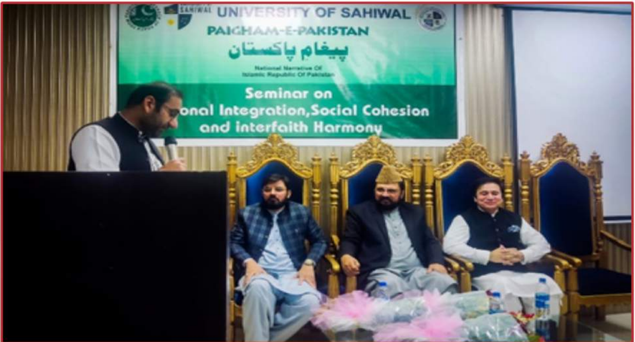
Seminar Organized by the Directorate of Student Affairs on “National Integration, Social Cohesion and Interfaith Harmony”.