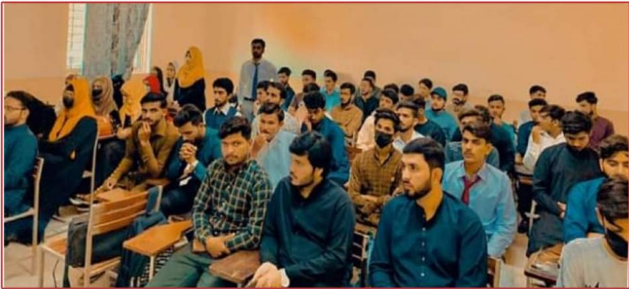
Orientation at The Department of Commerce