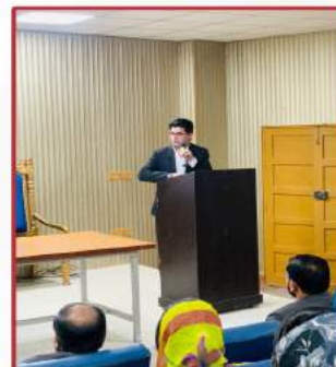
Orientation at The Department of English