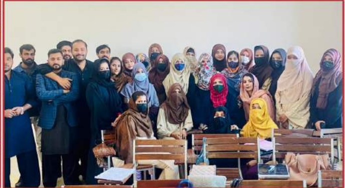
Celebrating Last Day of Semester with the Last Session of MSc. Applied Psychology